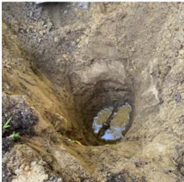
Example image of potholing to reveal a curb stop and identify water service material.